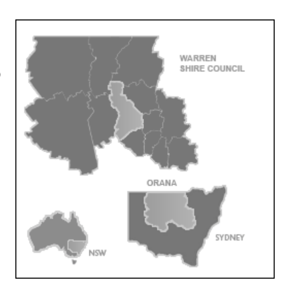
Local Government Area Map

The first European settlers moved into the area in the early 1830s taking up land, or "squatting" in the surrounding district, and Warren was gazetted as a town in June 1861. Prior to this settlement the sole owners and occupants had been the traditional custodians of the country, the Wayilwan / Weilwan tribe.